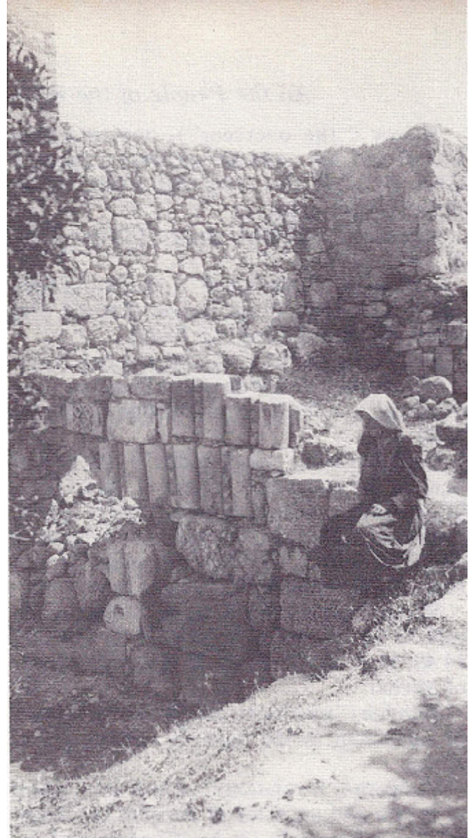
House of Mary and Martha. Christ visited the home of Mary and Martha at Bethany, where He ate a meal. This is the traditional site of their home. Martha complained that Mary was not helping in preparation of the food; Christ replied that Mary had chosen a better task by remaining to converse with Him (Luke 10:38). Six days before Passover, Christ again ate a supper at Bethany. On this occasion, Mary anointed the Lord's feet with precious ointment, wiping them with her hair (John 12:1-8).

Mattaniah ("gift of Jehovah"). [1] The original name of King Zedekiah (2 Kings 24:17). [2] A descendant of Asaph whose family dwelt at Jerusalem (1 Chron. 9:15;