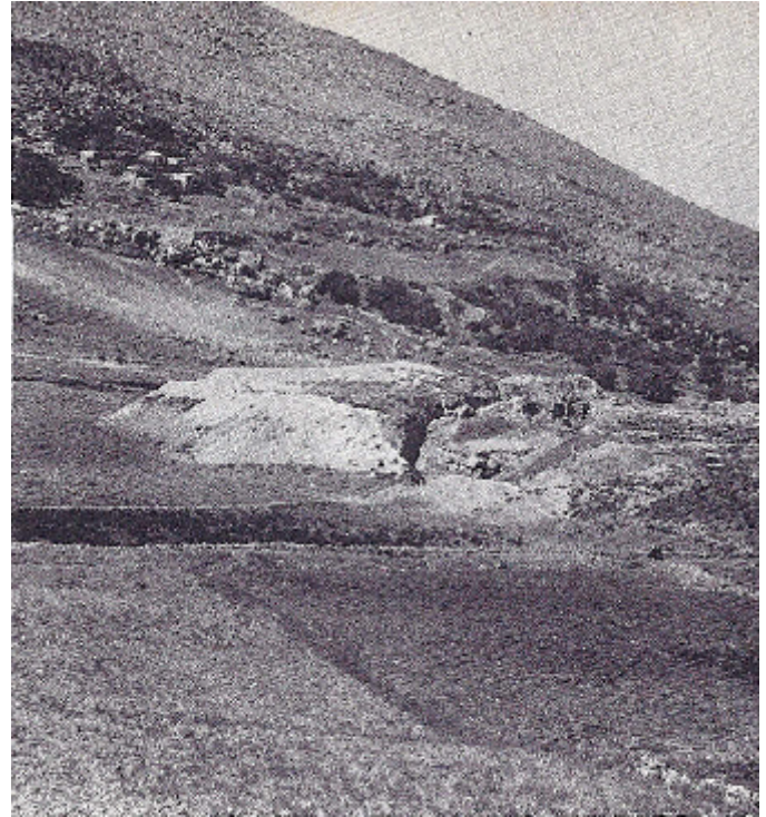
Jeroboam's capital. King Jeroboam of Israel fortified the city of Shechem and made it his capital for a time. Jeroboam incurred God's wrath by building shrines in Dan and Bethel to rival the Jerusalem temple.

Jehoash [Joash] ("Jehovah has given; Jehovah supports"). [1] The ninth king of Judah. Until the time of Jehoiada the priest's death Jehoash followed God; afterwards, he brought idolatry and disaster to his country (2 Kings 11:21-12:21). He is more frequently called by the shortened form of his name, Joash. [2] The