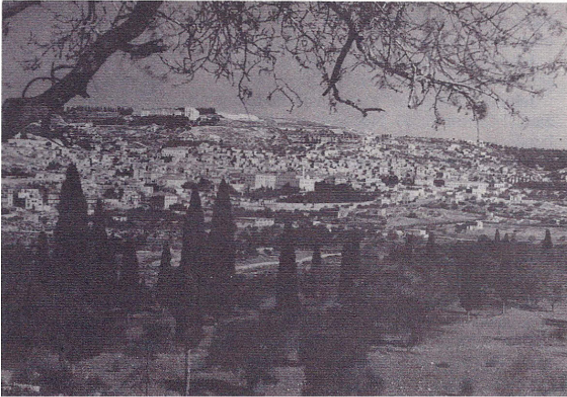
Jesus' hometown. This town in Galilee was the home of Mary and Joseph (Luke 2:3-9). Jesus lived here for about 30 years, and He was therefore called "Jesus of Nazareth." Nazareth sits in a high valley about 360 m. (1,200 ft.) above sea level, among the southernmost limestone hills of the Lebanon range.

returned from the Babylonian Captivity (Ezra 8:7). [5] A descendant of Merari who returned from Exile (Ezra 8:19). [6] One whose descendants dwelled in Jerusalem (Neh. 11:17).