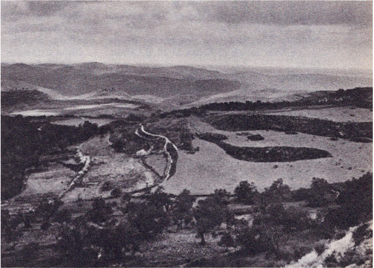
Land of Ephraim. The prophet Hosea predicted that God would punish the tribe of Ephraim, which lived in these fertile hills north of Jerusalem (cf. Hosea 12-13). Hosea said, "Now they sin more and more, and have made them... idols according to their own understanding..." (Hosea 13:2).