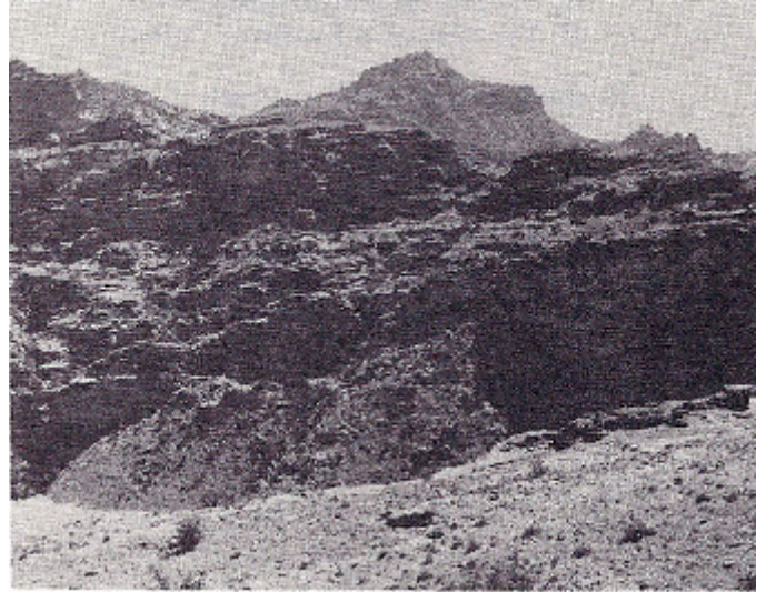
Mount Hor. The burial place of Aaron (Deut. 32:50), Mount Hor is traditionally identified with the modern-day peak of Jebel Nebi Harun. Over 1,500 m. (4,800 ft.) high, the mountain stands to the west of Edom.

In a few cases, our English versions use the same word to transliterate several similar Hebrew names. In these instances, we have recorded a separate entry for each Hebrew name (e.g., Iddo).